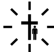
CENTER OF MY LIFE